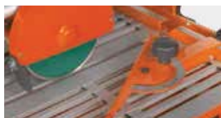
CUTTING GUIDE WITH ANGULAR SETTING