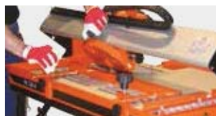
TILTING HEAD (0 TO 45°)