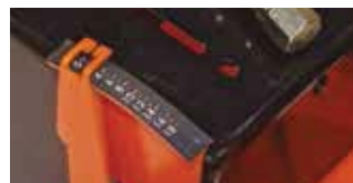
CUT DEPTH INDICATOR