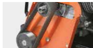
PULLEYS WITH REMOVABLE HUB AND POLY V-BELTS