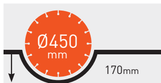
MAX CUT DEPTH