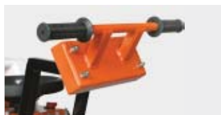
LOW VIBRATION HANDLEBAR